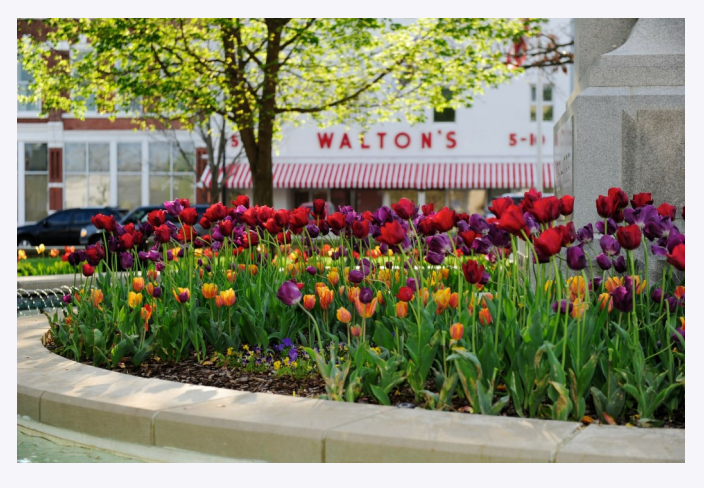
AFGC Avenues and Adventures

The entire article may be found in "About You", May 2023 issue. Congratulations, members of Bentonville Garden Club. AFGC appreciates the difference you have made through the projects you have done. Members strive to make Bentonville the most beautiful and friendliest city in northwest Arkansas.