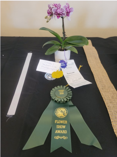
Pam Ellis, Grower's Choice