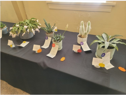
"Fall Welcome" to guests arriving at 2022 Pulaski District Meeting in November, at Hillcrest Hall.