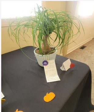
Glenda Tolson, Blue Ribbon, Ponytail Palm