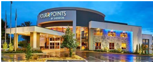
Four Points Hotel by Sheraton Little Rock, Arkansas

The April issue of the AFGC newsletter is a little bit unusual this month. It's been awhile since AFGC has hosted their annual convention, as well as the South Central Region convention back to back. The amount of work and planning that has gone into this is unbelievable.