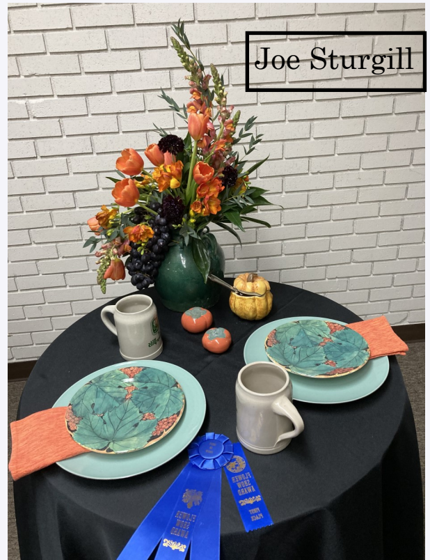
Design Division Blue Ribbon Winners