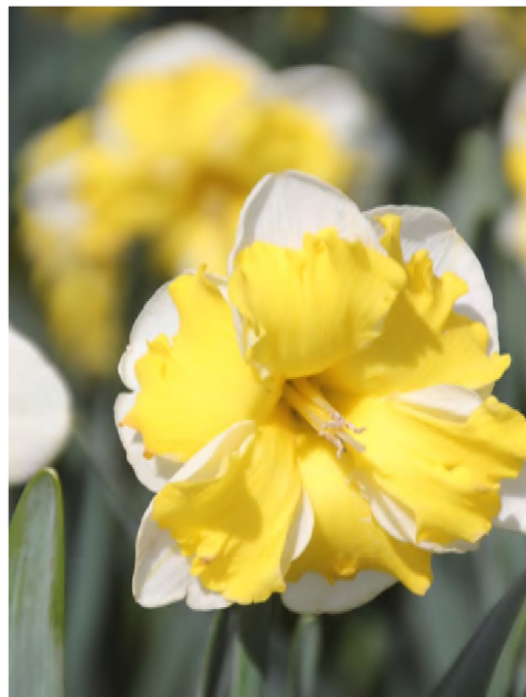
N. 'Plant America' Item # 01-1135

(A percentage of sales will be donated to the PLANT AMERICA Community Project Grants Fund of NGC).